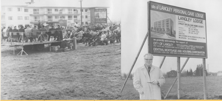
February 1973 Sod Turning Ceremony