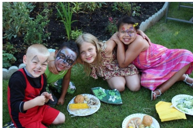
Some of our younger guests enjoying the fun, food and face painting at the Pork Roast.